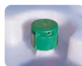
> Two-position venting, Viton sealing gasket