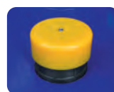
> Anti-depression venting