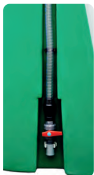
> Frontal venting, valve DN25