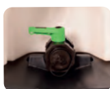
> Ball valve DN50 in GRP, Viton sealing gasket