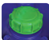
> Cover DN150 special Viton sealing gasket