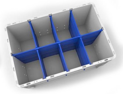
Short solid divider combinations: